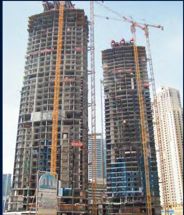
West Tower, and show apartment fixture and fittings.