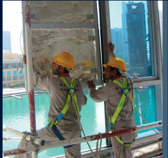
West Tower, Central Tower and Podium construction.