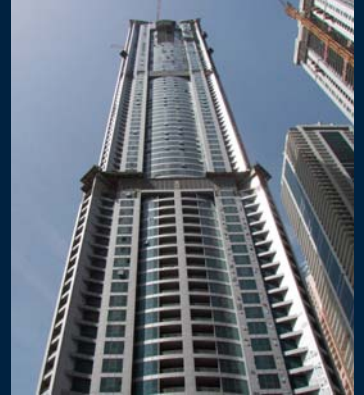
The Torch Tower